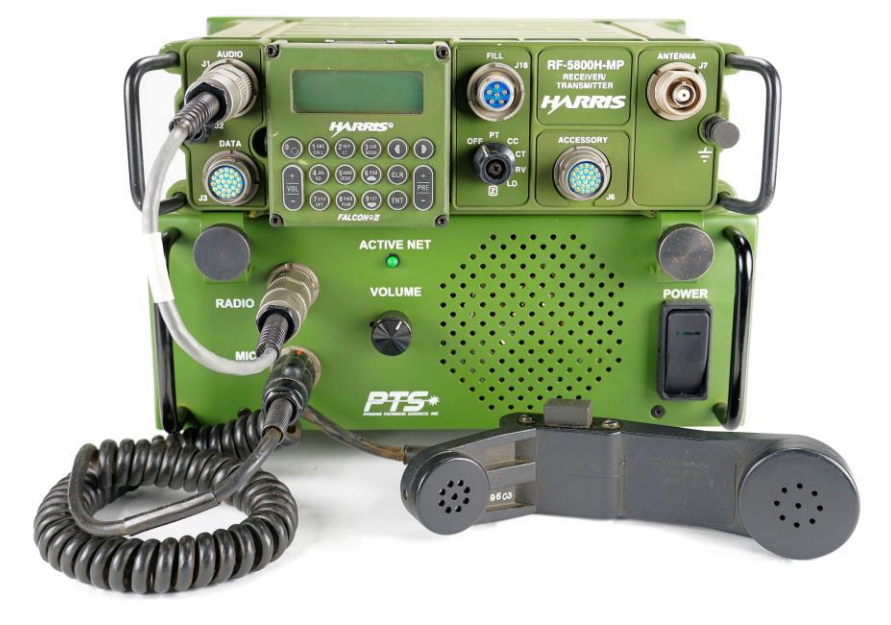
AS0150-HR-150 shown with unit supplied radio and accessories