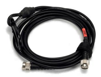
6. UHF Connection Cable