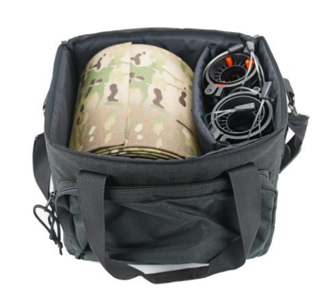
Antenna System Shown Bagged