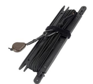
5. Hoist Rope