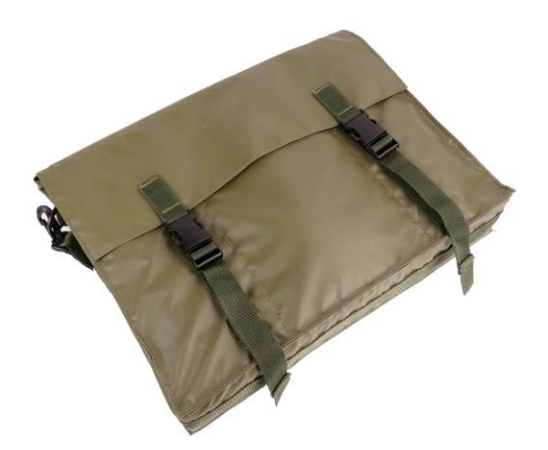
Antenna System Shown Bagged