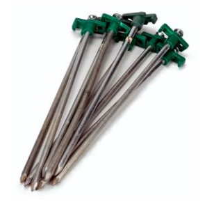
8. Guy Wire Stakes (Rock Pegs)