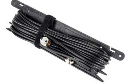
6. Antenna Feedline