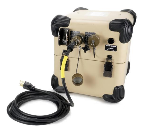
1. PWR-BTR-00203 24V DC PWR Source with AC PWR Cable Connected