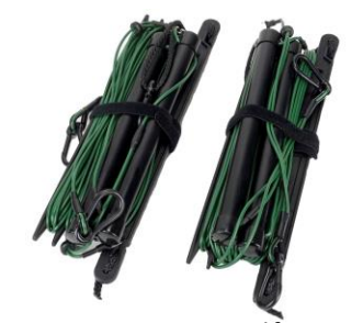
3. Antenna Half