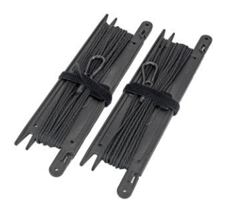
4. Tie Downs