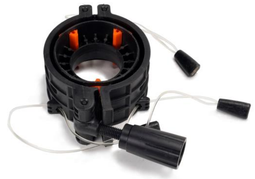
3. Secondary Collar