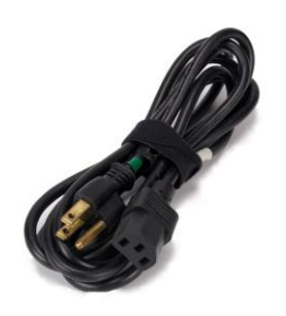
2. 110V AC PWR Cable