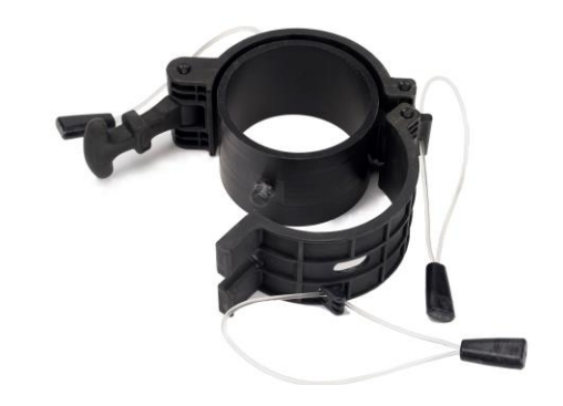
2. Top Collar